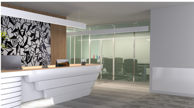
AFR Wall Application