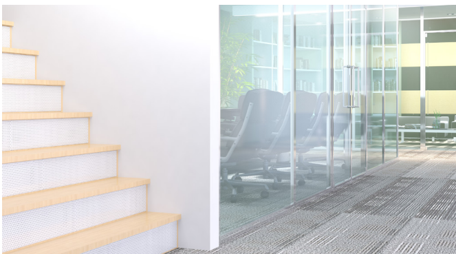
AFR Stair Riser Application