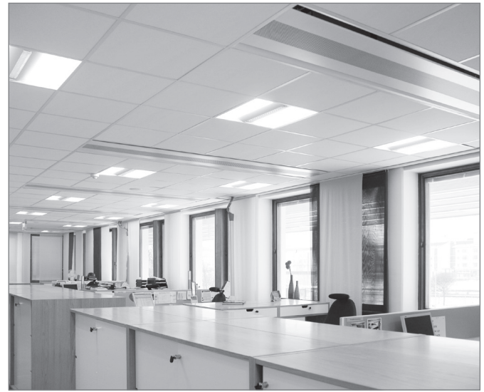
Open Office Application