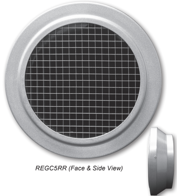
REGC5RR (Face & Side View)