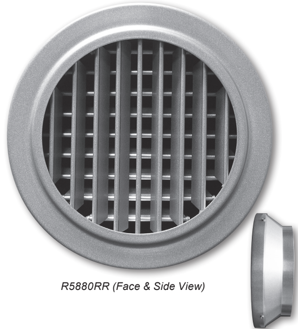
R5880RR (Face &amp; Side View)