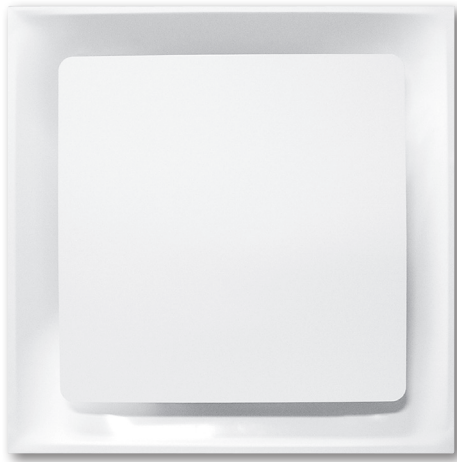
PLQLT, Face View