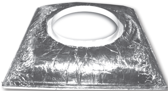
PLQLT, Back View of Backpan