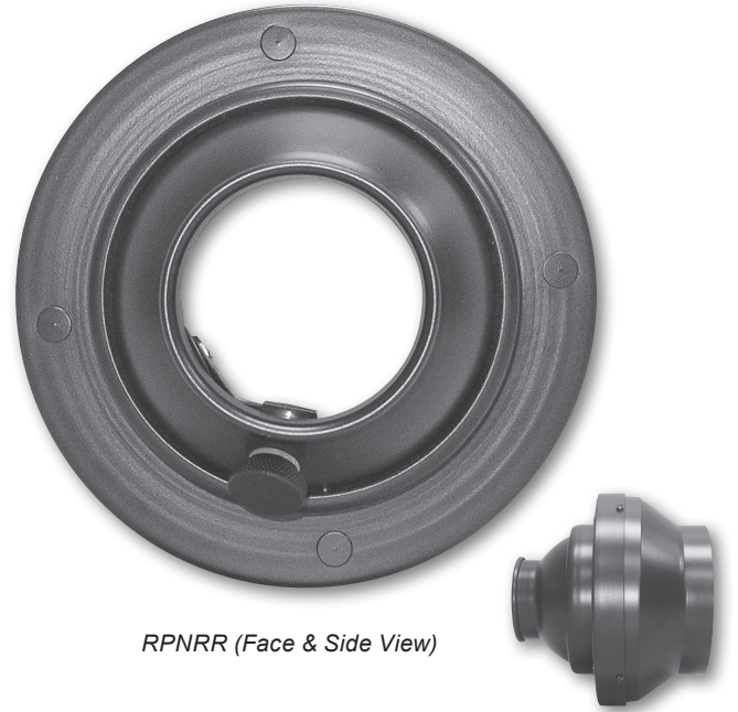
RPNRR (Face & Side View)