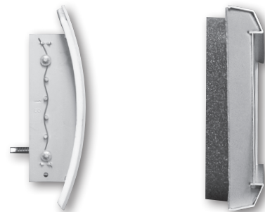
5DMGPR Radius End Cap side view (left) and 5DMGPU Universal End Cap side view (right).