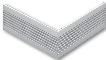
Corresponding mitered corner for Model 1500. WO construction shown.