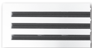
1900 with Butt Cut/End Cap and Blades