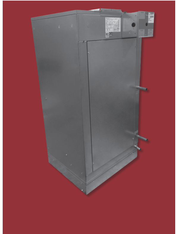
BLOWER COIL UNITS