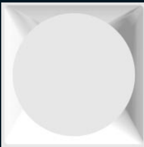
PLQ-R 24" x 24"