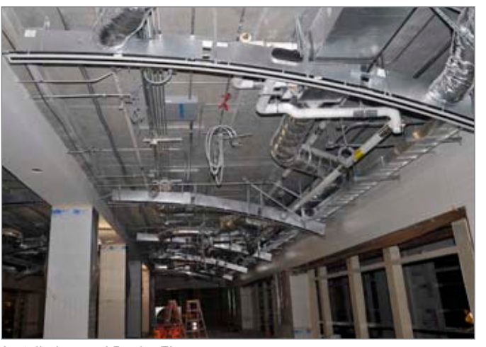
Installed curved DesignFlo.

Now, the project is nearing its final stages and we are all looking forward to seeing the engineering vision come to life with travellers making their way through Terminal 3 at McCarran International Airport!